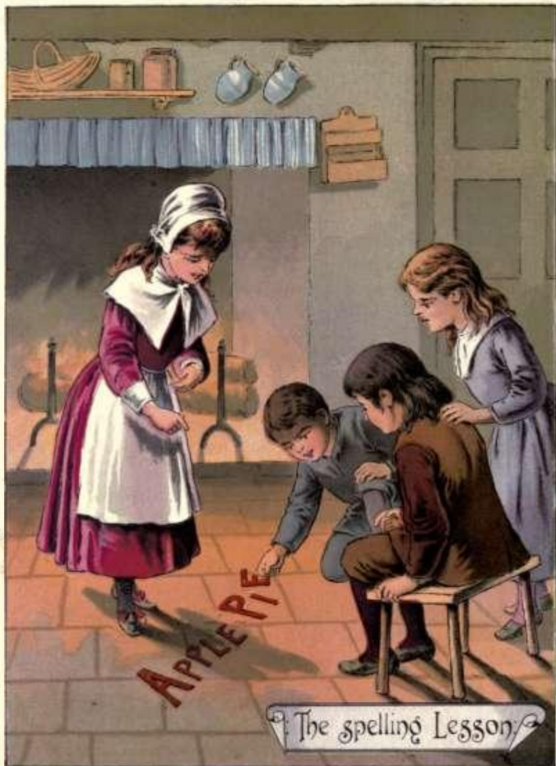
The spelling Lesson